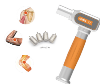
PS3 High Energy Muscle Massager Gun