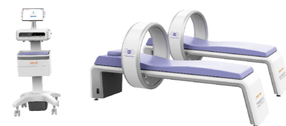
PM2 Alternating Magnetic Field Therapy Bed