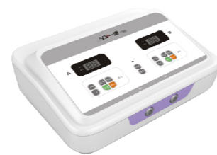
PE2 Intermediate Frequency Electrotherapy Apparatus