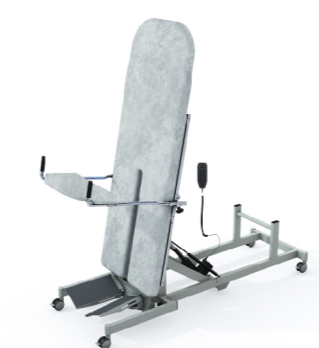
YK-8000E1 Electric Tilt Bed