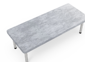
PC1 Physical Therapy Bed