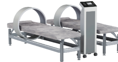
YK-5000B Alternating Magnetic Field Therapy Bed