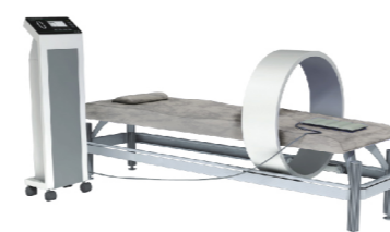
YK-5000A Alternating Magnetic Field Therapy Bed