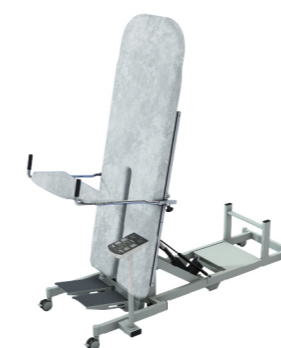
YK-8000E2 Electric Tilt Bed