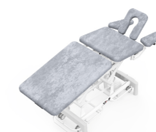
YK-8000C4 Multi-Position Medical Treatment Bed (Five Sections)