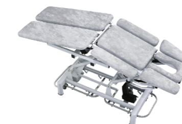
YK-8000C1 Multi-Position Medical Treatment Bed (Eight Sections)