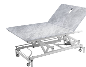
YK-8000A Electric Bobath Bed