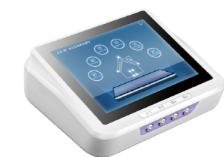
PE1 Neuromuscular Electrotherapy Stimulator