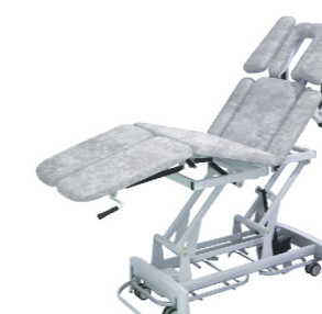
YK-8000C2 Multi-Position Medical Treatment Bed (Nine Sections)