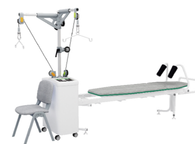
YK-6000D Traction Table with Heating System