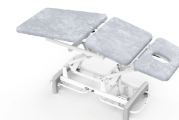
YK-8000C3 Multi-Position Medical Treatment Bed (Three Sections)