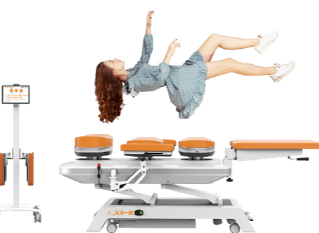
A12 Multi-Position Medical Diagnosis bed